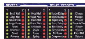
Active Reverb/Effects Matrix displays which two effects are active at all times.