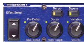
Dual Independent Controls for each Processor.

Those using the MX200 in the live arena will appreciate its intuitive front panel layout, with an Active Reverb/Effects Matrix that constantly displays which two of the 32 available effects are active, and all functions available within a single button-push turn of a knob. Dual independent processor control areas with dedicated Effects Select, Tempo, Bypass and three parameter control knobs provide instant access with precise and meaningful control over the most critical parameters for the selected effect. Parameter change LEDs illuminate to indicate any change from the 99 meticulously crafted Factory or 99 User Programs. Choose from five digitally-recorded audio samples to Audition the selected effects.