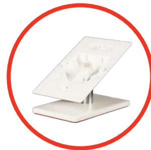
TEC-X-TM Table mount

Biamp and Apprimo are either trademarks or registered trademarks of Biamp Systems, LLC in the United States and other countries. Other product names referenced may be trademarks or registered marks of their respective owners and Biamp Systems is not affiliated with or sponsored by these companies.